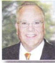
Bill Lockyer* Treasurer

Telling the truth. Fighting for honest, balanced budgets. Working for a change in Sacramento. Creating thousands of jobs.