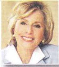
Barbara Boxer* US Senator