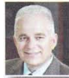
Tom Griego Los Angeles Superior Court Judge #117

No en la Proposición 27. Pare el poder de los políticos, que los votantes mantengan el poder. Haga mas facil votar a politicos ineficaces fuera de oficina!