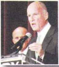
Jerry Brown* Governor